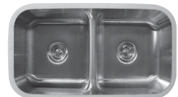
Model: E-150 Outside dimensions: 33" x 18-1/2" Inside dimensions: Each bowl: 14-1/4" x 16" x 7-3/4"

Crafted from high quality T-304, 18/10 stainless steel, all Edge sinks are constructed from heavy 18 gauge stainless steel with a brushed satin finish for long lasting beauty and durability. Initial designs include a double bowl, two single bowls and a bar sink, with more designs to follow.