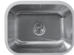
Model: E-120 Outside dimensions: 23-1/2" x 18-1/4" Inside dimensions: 21" x 15-3/4" x 8-1/2"

In its place, a unique resin matrix specifically designed for seamless integration in laminate, solid surface and stone. No longer do you need a rim, an overhang or a reveal in your sink installations. Pure seamless integration is now achievable with the new Edge sinks by Lansen.