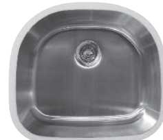
Model: E-130 Outside dimensions: 23-3/4" x 21-1/4" Inside dimensions: 21-1/4" x 18-3/4" x 8-1/2"