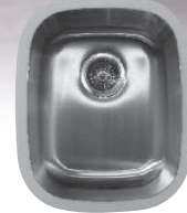
Model: E-110 Outside dimensions: 15-1/2" x 19" Inside dimensions: 13" x 16-1/2" x 6-1/2"

EDGE is a revolutionary leap forward in the design of a stainless steel sink. Gone is the traditional rim.